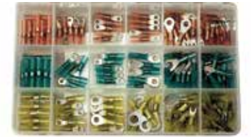
10600 Assortment Proseal Connector Kit