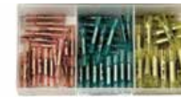
10054 Proseal Butt Splice Connector Minipack