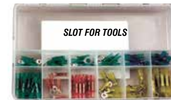
10723 Proseal Connector Kit with Tool Slot