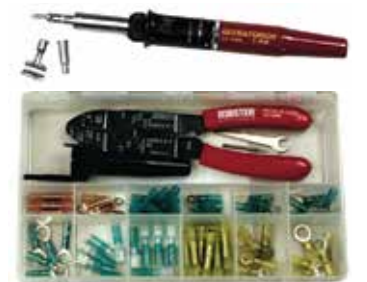
10719 Proseal Connector Kit with UT-100Si & Crimper